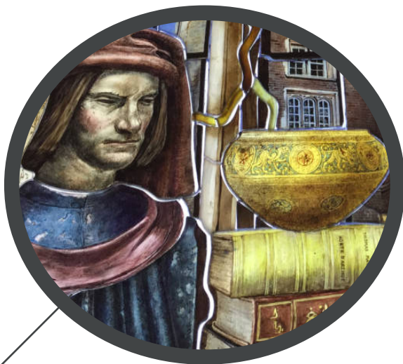
Detail from Roots of Knowledge

Last year, we focused on working with faculty, students, and administration to set the course for fulfilling the mission of this project. We ended the year with great progress, but we still have much to accomplish before we fully implement all of our grand plans. Through all of this, Roots of Knowledge was a source of pride for the campus and especially the Library.