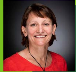
Anne Arendt College of Engineering & Technology Kyrgyz Republic – Utah IT Forum