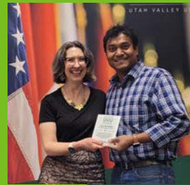
Sayed Sajal College of Engineering & Technology International Mother Language Day