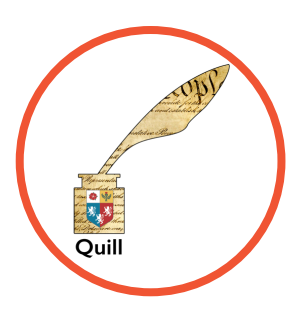
Wood Research Assistants