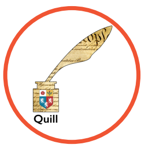
Wood Research Assistants

I loved learning about federalism and state constitutions -- a reminder to emphasize that more in my classroom. I loved the federalism applied lesson presented today about federalism.