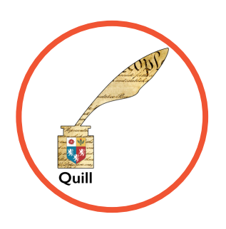
Wood Research Assistants