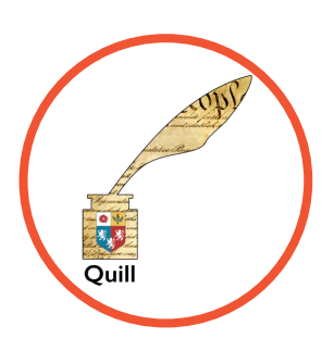
Wood Research Assistants