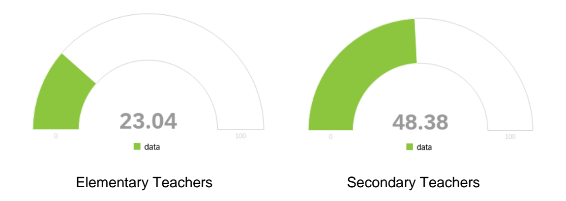
Figure 2 - Portion of Instructional Time Spent on Civics-Related Topics and Activities

It may be that while these teachers value civics (as our previous findings suggest), they nevertheless spend less than half their time teaching civics. However, it is likely that some of these teachers have a narrow definition of what "civics" is, and thus do not always recognize civics content when they teach it (for example, limiting "civics" to facts about government, not the skill of engaging with those who disagree). Regardless, the relatively low percentage of instruction dealing with civics makes understanding the incentives and disincentives teachers face, and the lack of civics resources available, all the more important to understand.