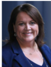
Hon. Virginia Kendall United States District Court ND IL