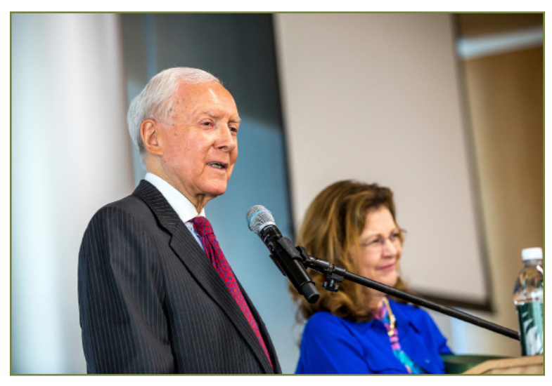
Senator Orrin Hatch & Elaine Englehardt Thirtieth Anniversary Celebration of Ethics & Values