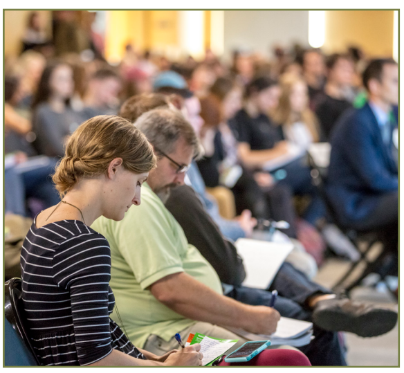
2017 Ethics Awareness Week

The CSE Faculty Fellowship Program is designed to facilitate faculty inquiry and scholarship in interdisciplinary ethics. Projects may address ethical issues in a variety of disciplines and fields of