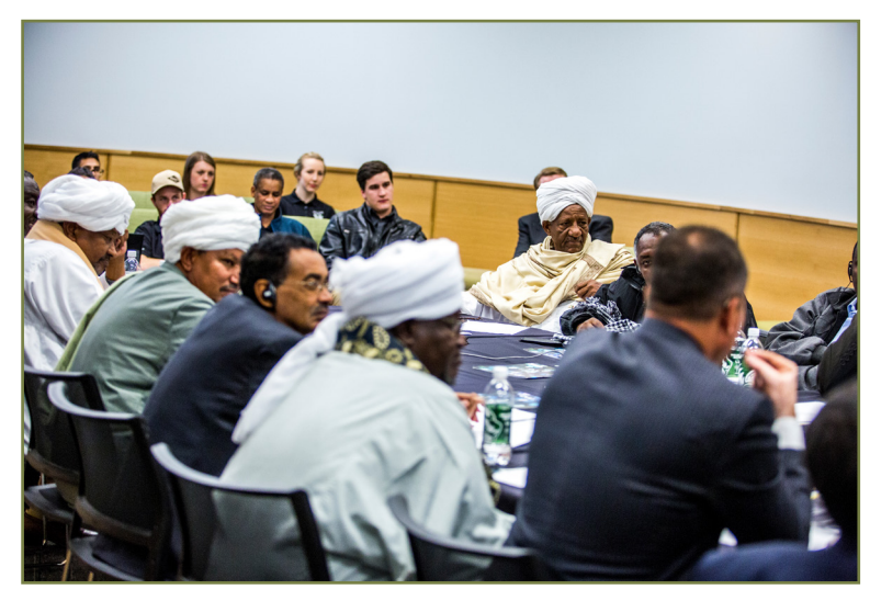
Ethics Center hosts 2016 delegation of Imams from Sudan on American religious diversity

The CSE works across campus to in support of ethical engagement across cultures. This includes a focused collaboration with our Peace and Justice Studies Program on issues related to conflict transformation. Students have engaged the complexities of ethics and culture from Northern Ireland, the Balkans, and China to more regional contexts including native populations and our growing refugee population.