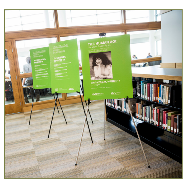
Diane Ackerman delivers keynote address 2015 Environmental Ethics Symposium