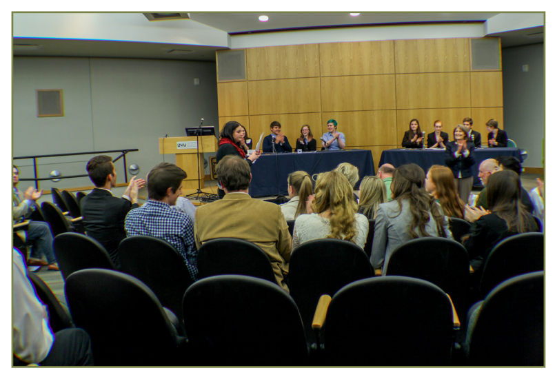
Championship Round 2015 High School Ethics Bowl

Periodic workshops provide faculty a forum to share resources and best practices for teaching Ethics & Values along with ethics related courses across campus. The CSE works with colleges and departments to identify the most effective form of training, collaboration, and support.