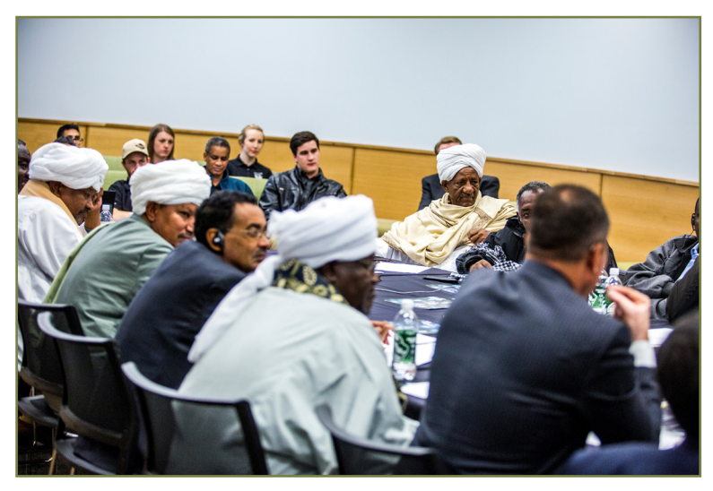
Ethics Center hosts 2016 delegation of Imams from Sudan on American religious diversity

The CSE works across campus to in support of ethical engagement across cultures. This includes a focused collaboration with our Peace and Justice Studies Program on issues related to conflict transformation. Students have engaged the complexities of ethics and culture from Northern Ireland, the Balkans, and China to more regional contexts including native populations and our growing refugee population.