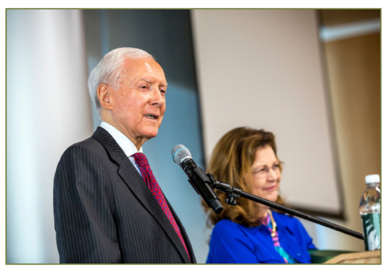
Senator Orrin Hatch & Elaine Englehardt Thirtieth Anniversary Celebration of Ethics & Values