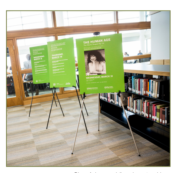
Diane Ackerman delivers keynote address 2015 Environmental Ethics Symposium