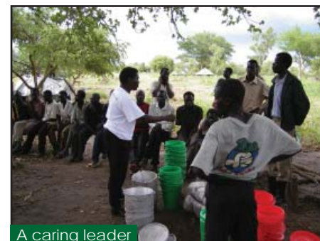
A caring leader