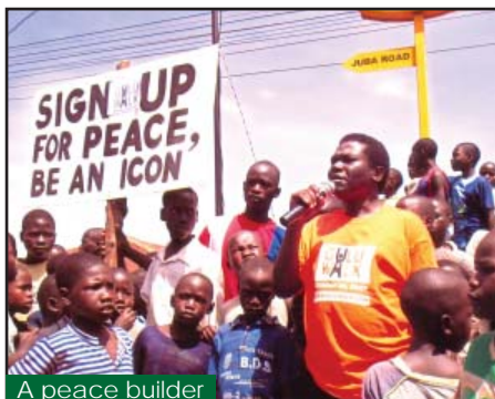
A peace builder

Mao has degrees in law and development studies. In