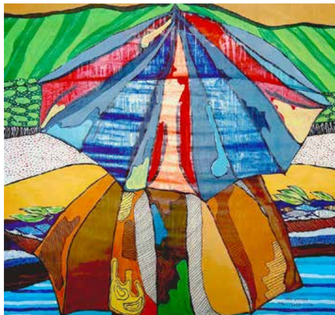
One of two paintings exclusively created to raise funds for the cultural center, depicting the symbol of Mt. Fako. A copy was gifted to the UVU Global Engagement Office.

In support of the cultural center, he created two original paintings specifically for auction at the MBANDO 2024 Cultural Festival. His work exemplifies how the arts can serve as a powerful medium for cultural expression and environmental advocacy.