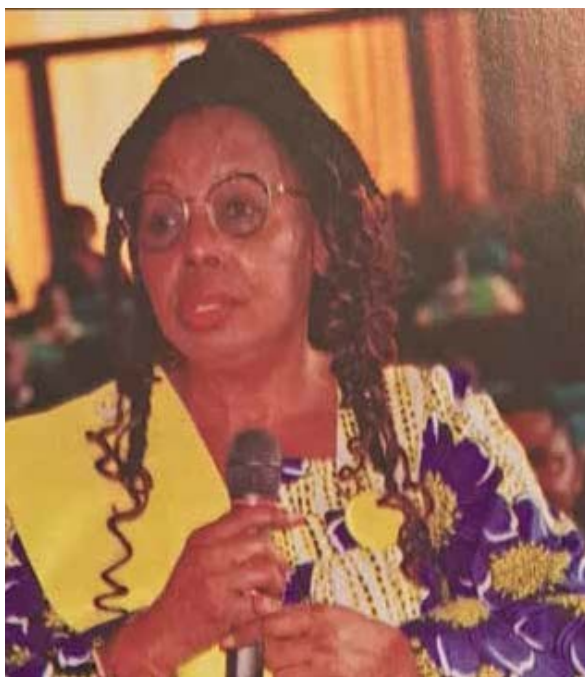
Rector of University of Yaounde1, Minister Nalova Lyonga, now head of Secondary Education.

Under the distinguished leadership of trailblazing women the culture of women's leadership in education has been proudly institutionalized in the region. FAWONE builds upon this foundation, offering scholarships to bright, underprivileged students, forging partnerships with institutions of higher learning, and collaborating with farmers' associations to support local food systems.