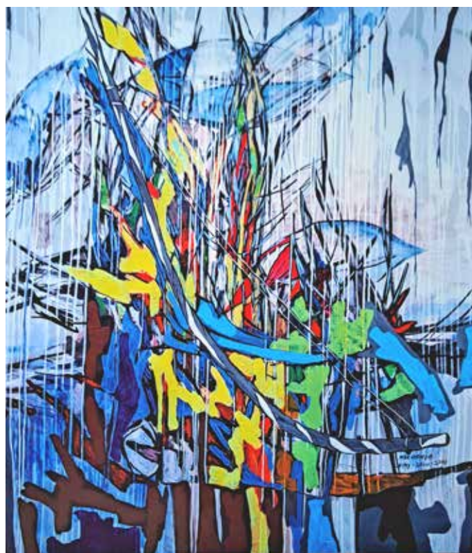
Second of two paintings by Max Lyonga exclusively created to raise funds for the cultural center.