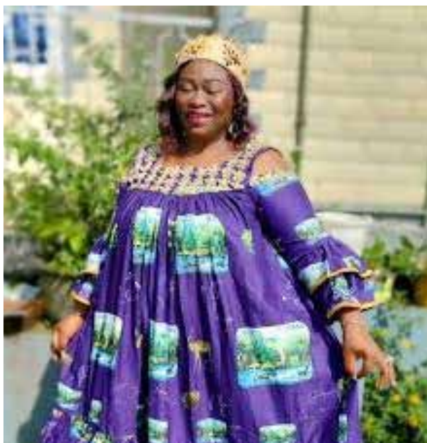
Fako Fabric worn at the 2023 Mbando Ya Hvako Cultural Festival

recipes, and cultural commentary. All proceeds from the magazine directly support the development of the cultural center.