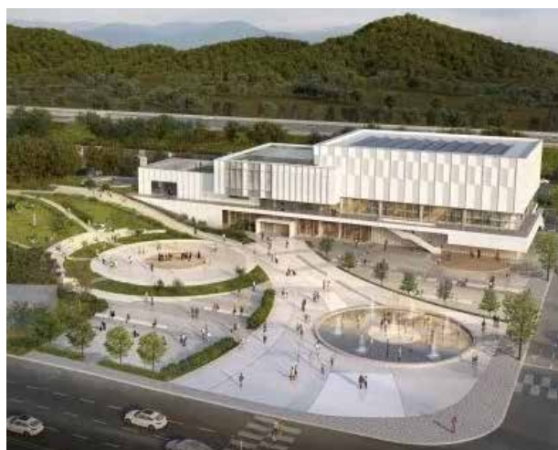
Rendering of the Fako Multipurpose Cultural Center, credits from the Buea Royal Palace website.

the exciting announcement of the Fako Multipurpose Cultural Center, a project currently being developed in Buea. This center will serve as a hub for cultural preservation, environmental education, and community development.