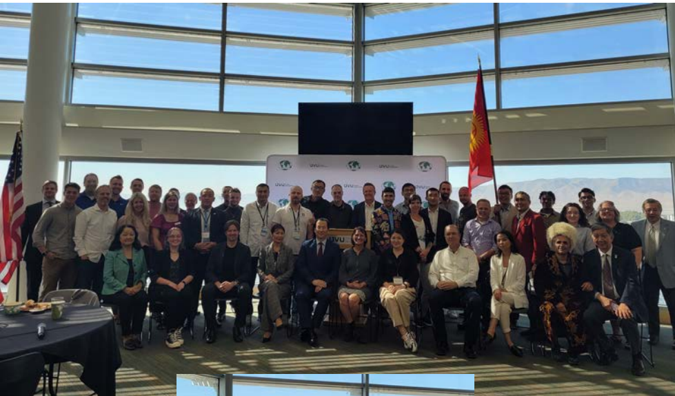
Delegation visiting Pluralsight