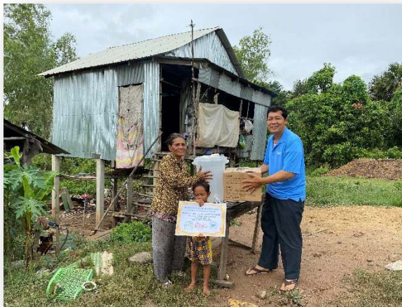
Viewing the handed-over distributional activity with the family