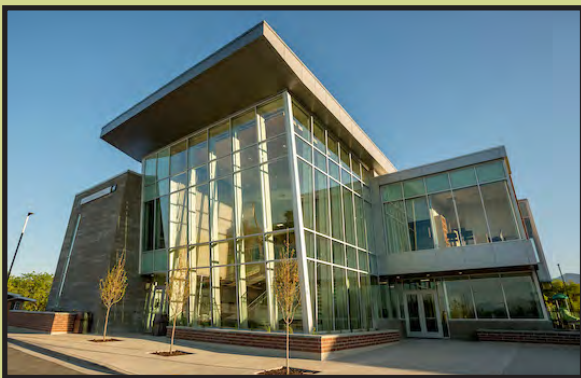
Article adapted from www.uvu.edu/autism and the UVU Press Release: UVU Partners with Community to Break Ground on New Autism Center.

For more information, visit www.uvu.edu/autism .