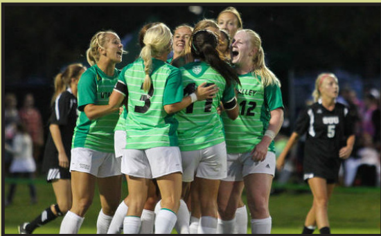
Article adapted from the UVU Wolverine Athletics article, UVU claims WAC tournament title with historic win over SU