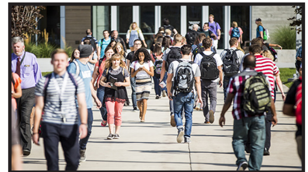
Article adapted from the UVU Press Release, UVU is the largest university in Utah, prepared to accommodate 6-percent growth.

institution's growth is especially remarkable considering its humble beginnings as a vocational school nearly 75 years ago. In the ensuing decades, UVU has evolved into a technical school, community college and state college before becoming a teaching-focused university in 2008. UVU will celebrate its 75th anniversary in 2016.