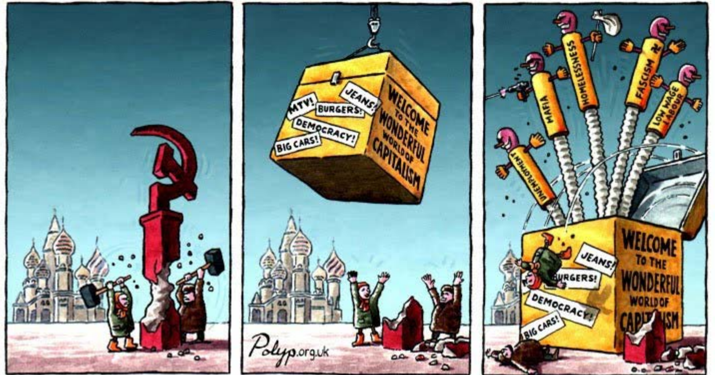
'JACK IN THE BOX'