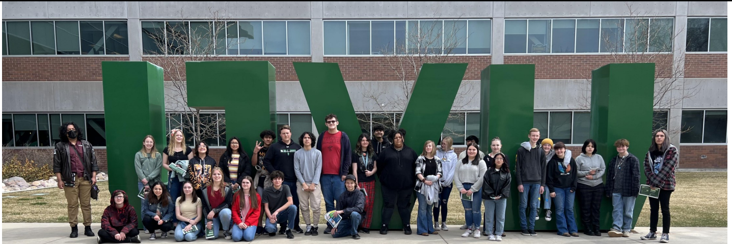
Talent Search students touring the campus of Utah Valley University