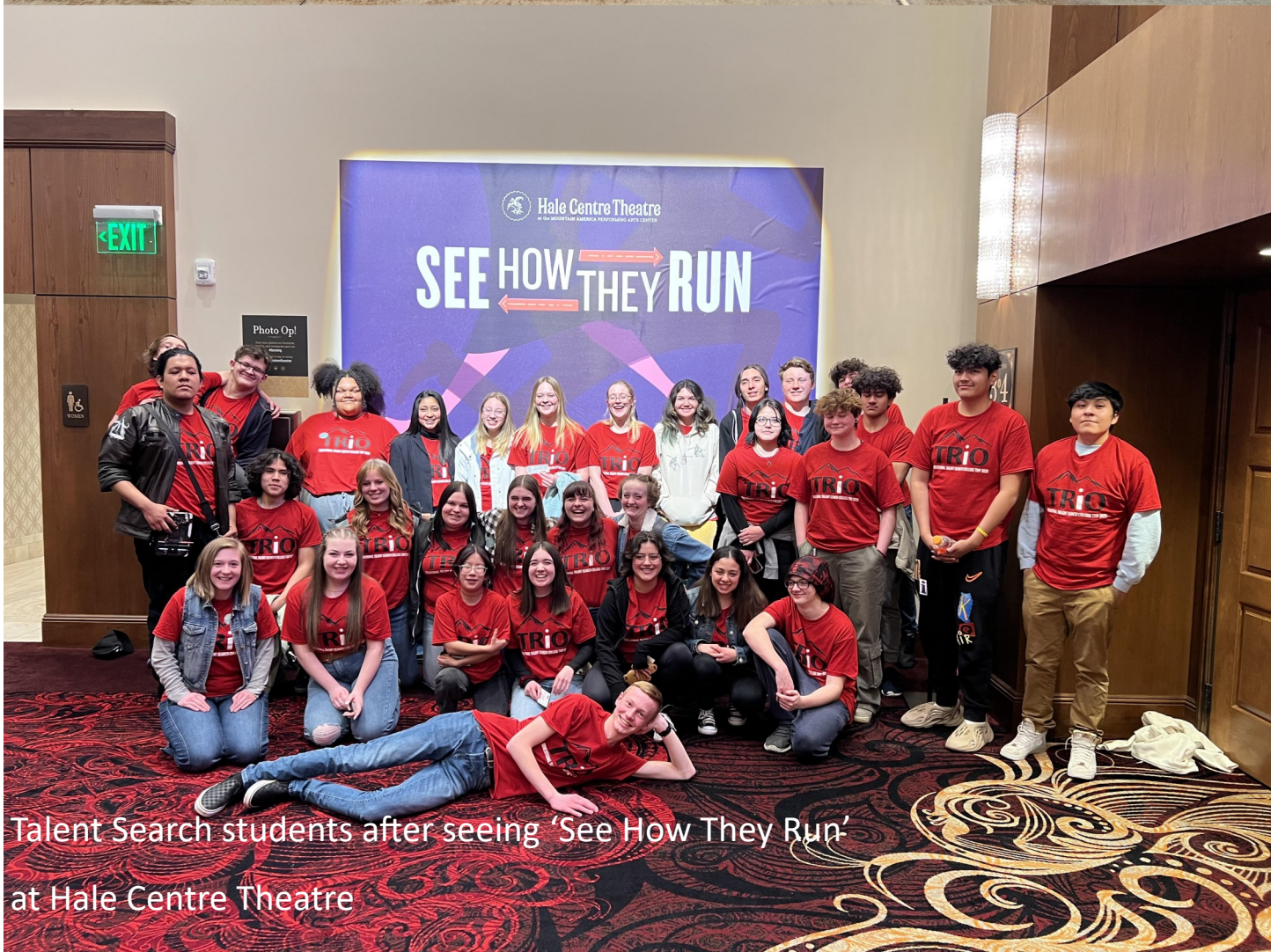
Talent Search students after seeing 'See How They Run' at Hale Centre Theatre