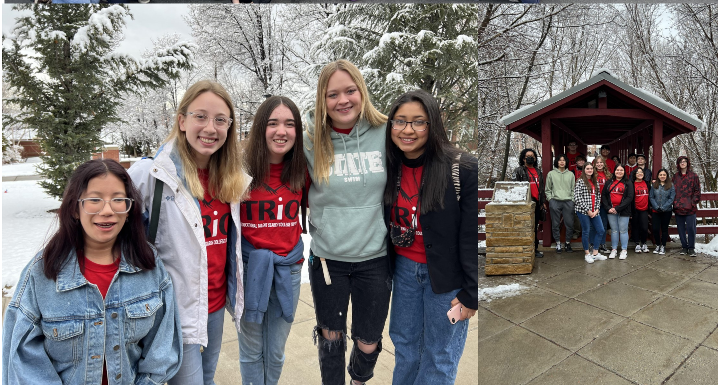
TRIO students on a college tour at Westminster University