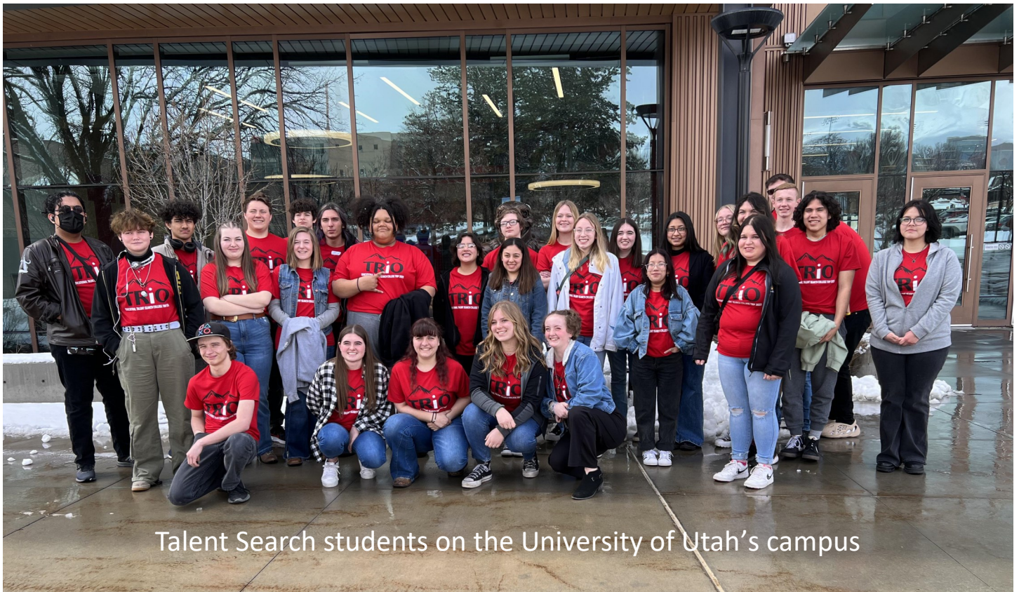
Talent Search students on the University of Utah's campus