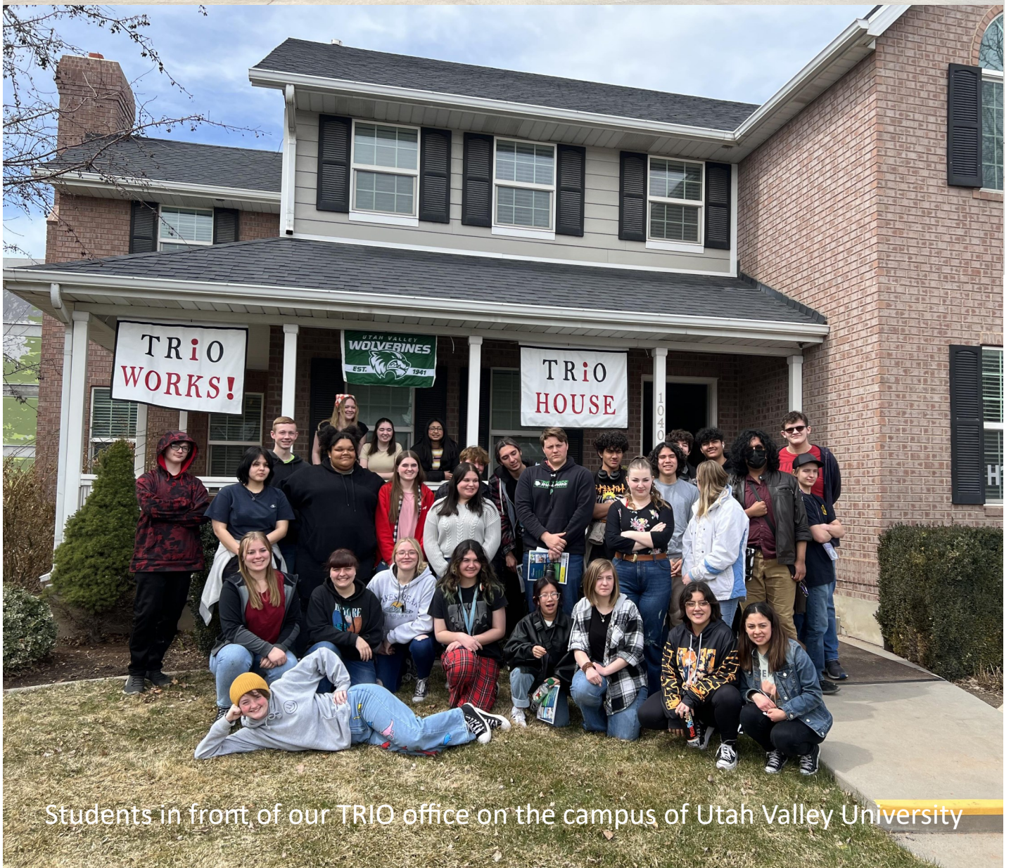
Students in front of our TRIO office on the campus of Utah Valley University