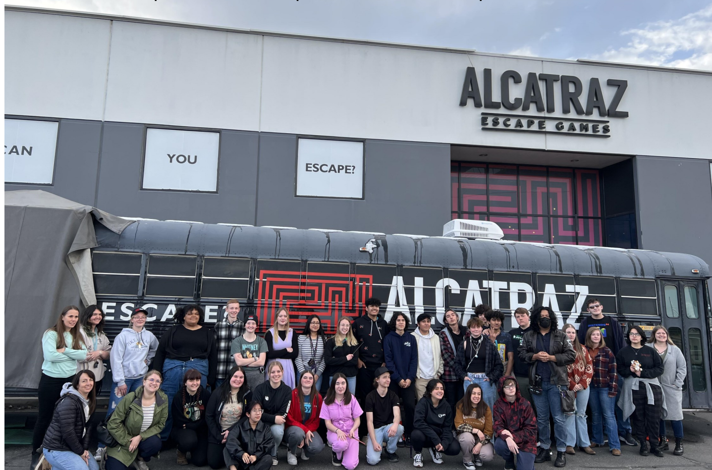
TRIO students outside of Alcatraz Escape Games after working together to solve puzzles and escape four different escape rooms.