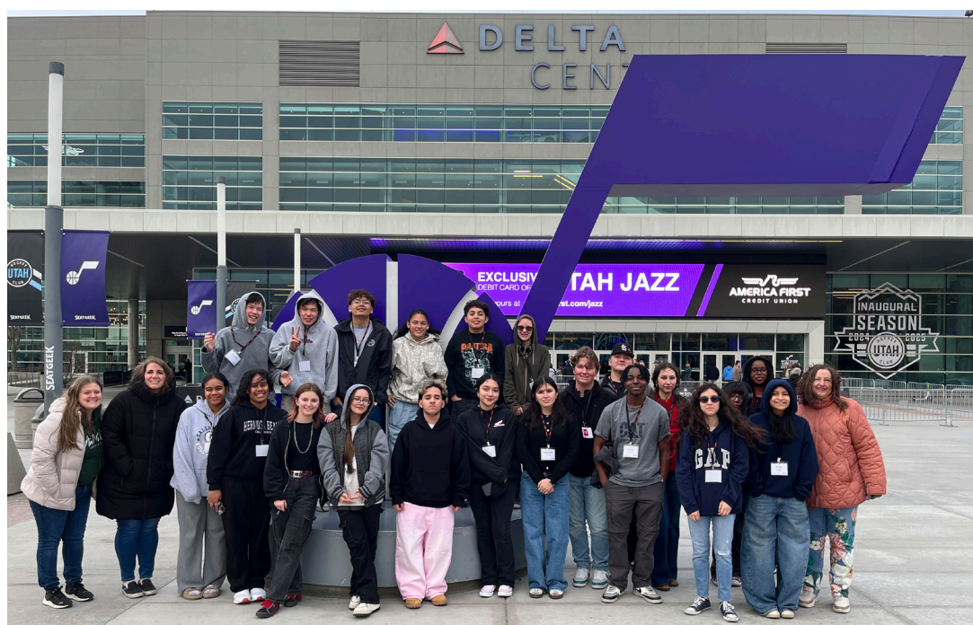
(RIGHT) TRIO TALENT SEARCH STUDENTS STANDING OUTSIDE THE DELTA CENTER NEXT TO THE UTAH JAZZ LOGO. THE STUDENTS TOOK IN THE GAME AFTER TOURING USU AND WSU. THE NEXT DAY THEY TOURED U OF U AND UVU.