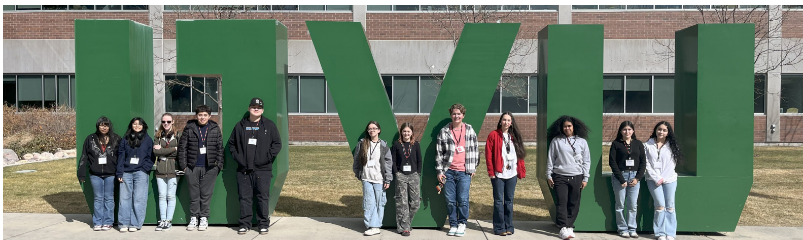
(ABOVE) TRIO TALENT SEARCH STUDENTS IN 'GROUP 1' STAND IN FRONT OF THE BLOCK UVU SIGN ON THE CAMPUS OF UTAH VALLEY UNIVERSITY.