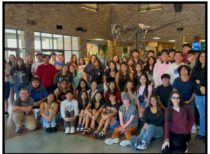
Weber State University TRIO Upward Bound students visit the Museum of Ancient Life at Thanksgiving Point.