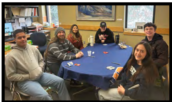
Snow College TRIO students at their "Sub Lunch and Game Day" event.