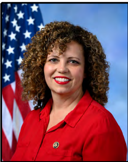
Congresswoman Celeste Maloy