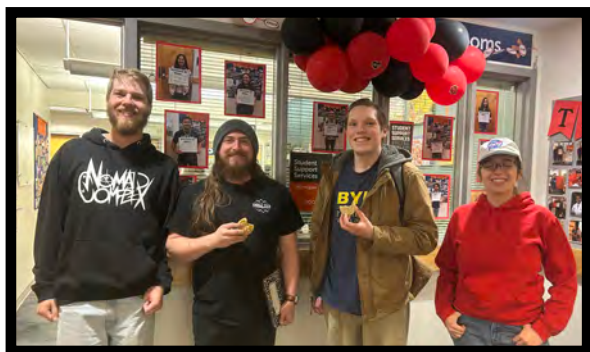
Snow College TRIO Student Support Services students celebrate National TRIO Day.