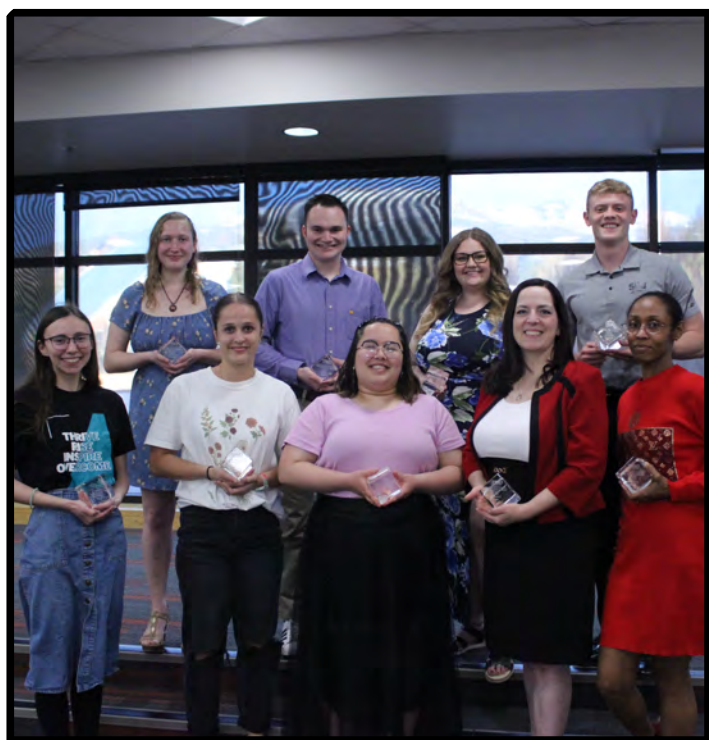
Southern Utah University TRIO SSS students receive awards last year.