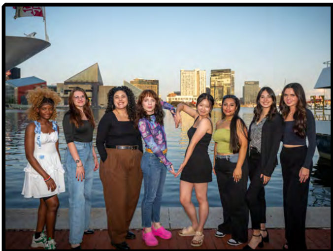
TRIO McNair Scholars traveled to the 2024 UMBC Research Conference in September.