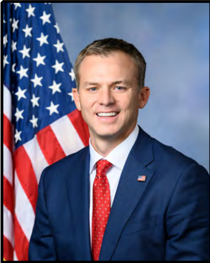
Congressman Blake Moore