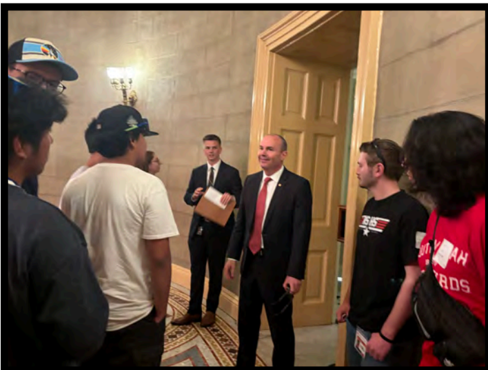
Snow College TRIO Upward Bound students chatting with Senator Mike Lee between his meetings during their educational trip to Washington, DC.