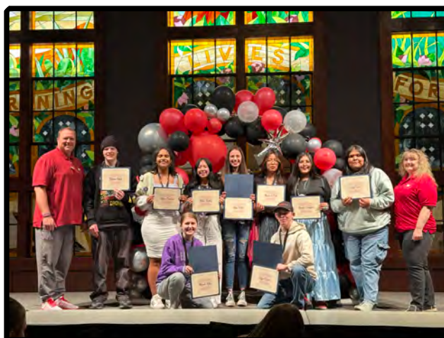
Southern Utah University TRIO Upward Bound students celebrate their accomplishments at their senior banquet.