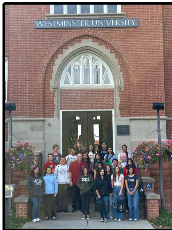
Southern Utah University TRIO Upward Bound students tour Westminster University.