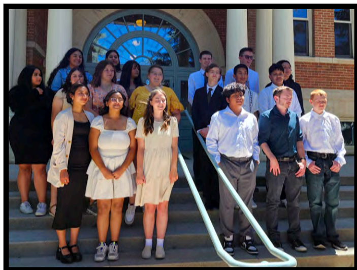
TRIO Upward Bound scholars on campus at Snow College.