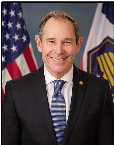
Senator John Curtis State of Utah