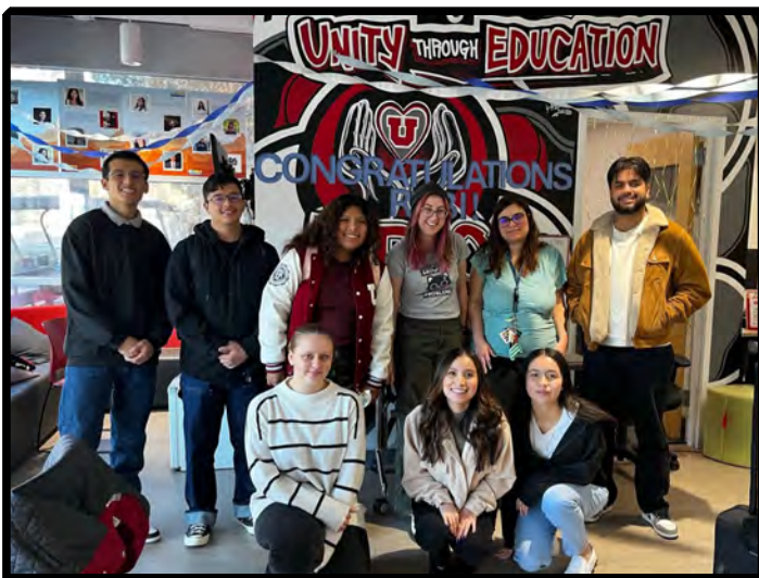
University of Utah students study together at the TRIO office at the University of Utah.

Luckily, joining the TRIO SSS-STEM program was a worthwhile decision I have made because it gave me a start towards connecting to the community. The people within TRIO were nice to me, exuding a sense of warmth and safety. They gave me opportunities that would help me through my situation academically, financially, and socially such as tutoring, study hall rooms, and text book checkouts. Textbook checkouts were a significant portion since I couldn't afford a lot during my transition and buying expensive textbooks would only worsen my condition. Now, I volunteer and work as a tutor in this program, solidifying my place in this community and taking a step forward towards a bright future.