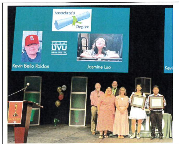
2023 UB Summer Program Banquet Two high school graduating seniors received their associate degree.