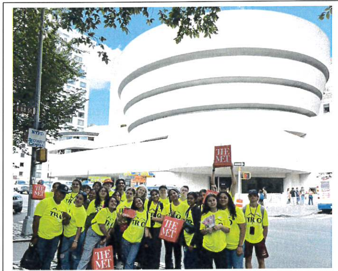
2023 UB Summer Program "Edventure" New York City, New York July 6-11, 2023