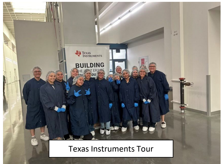
Texas Instruments Tour