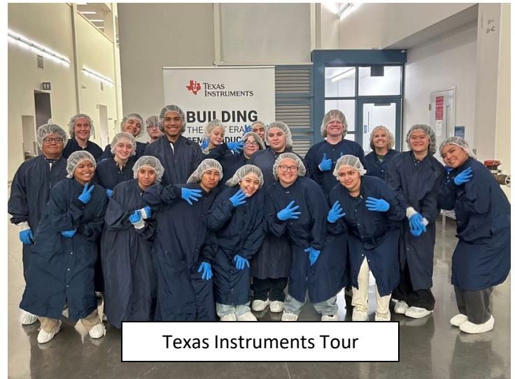
Texas Instruments Tour