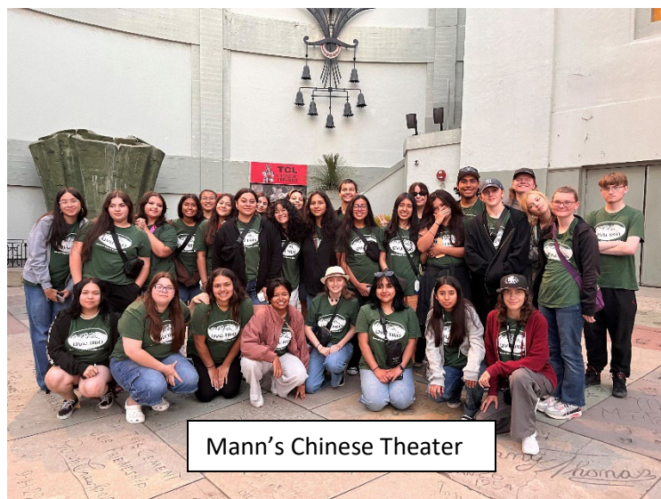
Mann's Chinese Theater