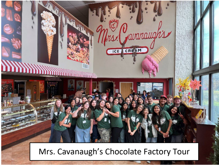
Mrs. Cavanaugh's Chocolate Factory Tour