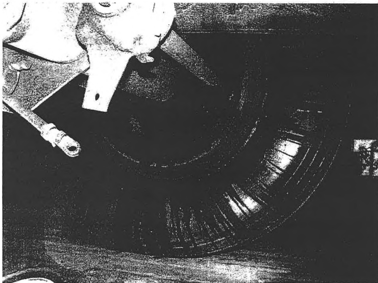
A drive axle that has a blown oil seal and the driver disconnected the push-rod from the slack adjuster so the brake would not operate or catch on fire.