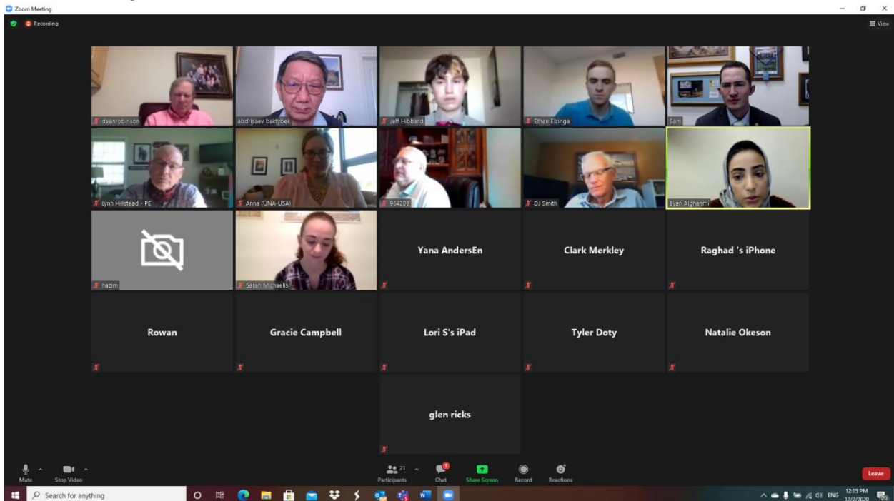
Participants of the IMD 2020 observation at UVU

The 11th annual International Mountain Day (IMD) observation at Utah Valley University, (UVU), was a wonderful way for me to learn about the importance of mountain communities and how we as students can contribute to Sustainable Mountain Development (SMD). The focus of this year's event was the importance of preserving biodiversity in mountains. This is especially relevant to UVU students given our community's close proximity to and reliance on the Wasatch mountain ranges.