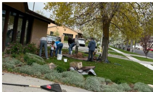
This month, the Logan Rotary Club met at Sunshine Terrace and illustrated the adage "many hands make light work." Rakes, shovels, trimmers, and weeders were plentiful. We had