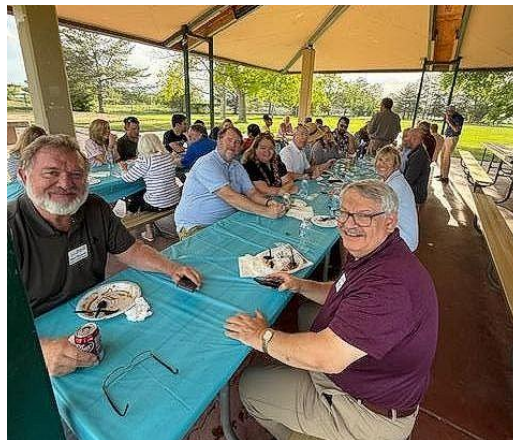
The joint Sugarhouse-Millcreek Rotary Club barbecue gave us the chance to mingle and enjoy good food! Rotarians are the best cooks!