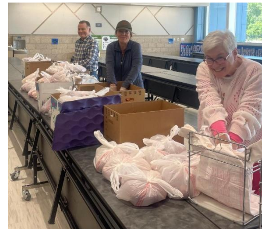
The Sandy Rotary Club were People of Action at the Utah Food Bank at Midvalley Elementary School in May!