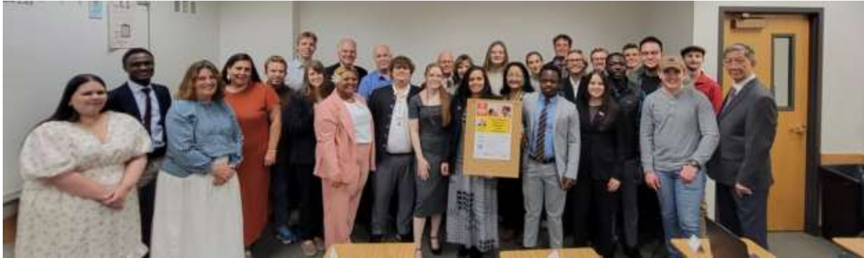
Group Photo of UVU Rotaractors and Participants of the Event

From my involvement I learned that global health advocacy can be grounded in local institutional action; small-scale events can amplify awareness even when the ultimate goal (eradication of a disease) is very large. I learned the importance of minute organizational detail and how successful execution depends on teamwork and contingency. I also learned how partnering with established organizations (Rotary, WHO) bolsters credibility and reach of student-led initiatives. I recognized that awareness alone is insufficient; the value lies in linking awareness to concrete actions and that building networks early, with students, clubs, professional organizations, fosters leadership capacity.