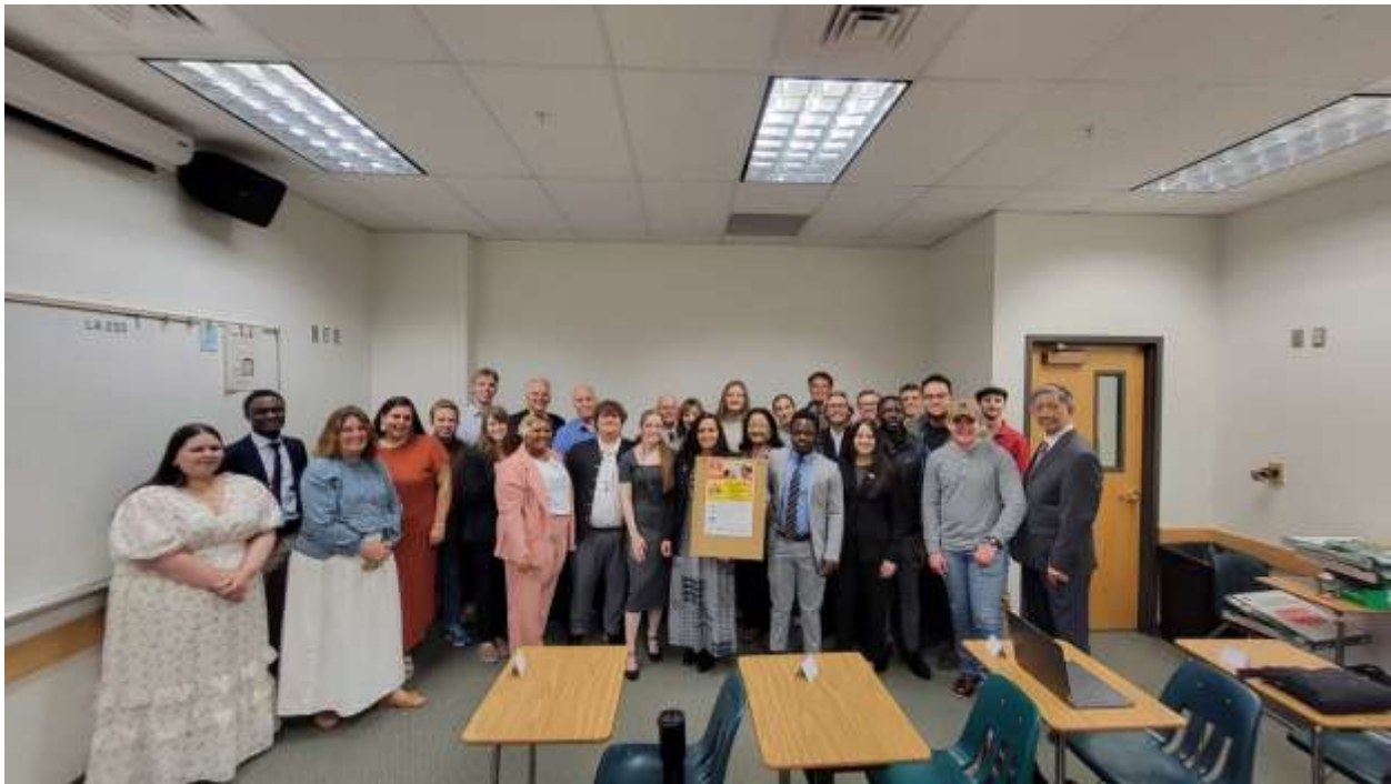
Group Photo of Participants at World Polio Day