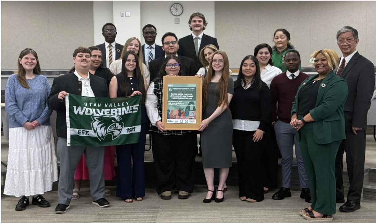
Group Photo after the Event