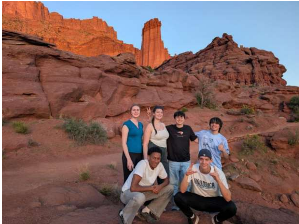
Youth Exchange explores Moab