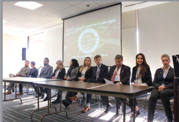
UVU delegation hosts a parallel event during CSW63

UIMF at the 63rd Session of the United Nations Commission on the Status of Women, March 18-21, 2019