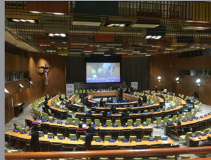
UVU Students make an oral statement at the United Nations

UIMF at the UN High -Level Political Forum on sustainable development, July 19, 2019