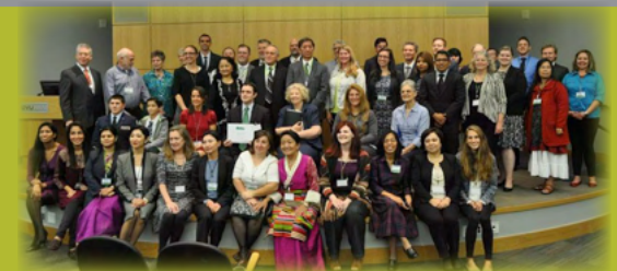
Participants of the Fourth International Women of the Mountains Conference held October 7-9, 2015 in Orem, UT

•For the first time, UIMF students hosted and organized the Fourth International Women of the Mountains Conference under the umbrella of the Mountain Partnership affiliated to the Food and Agriculture Organization of the UN